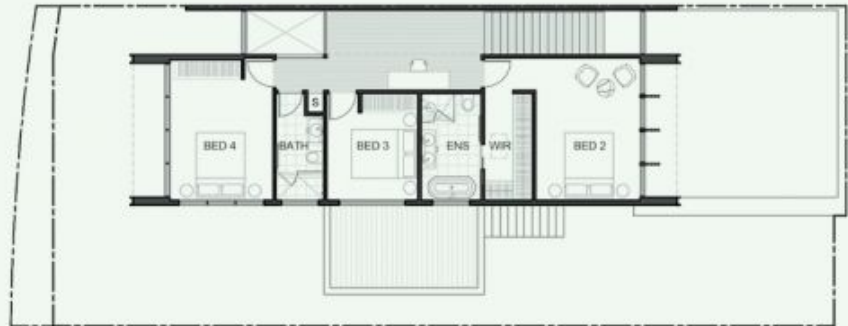
FIRST LEVEL PLAN