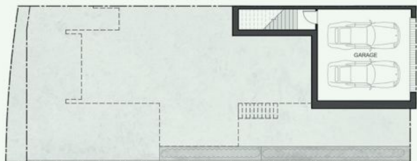
GROUND LEVEL PLAN