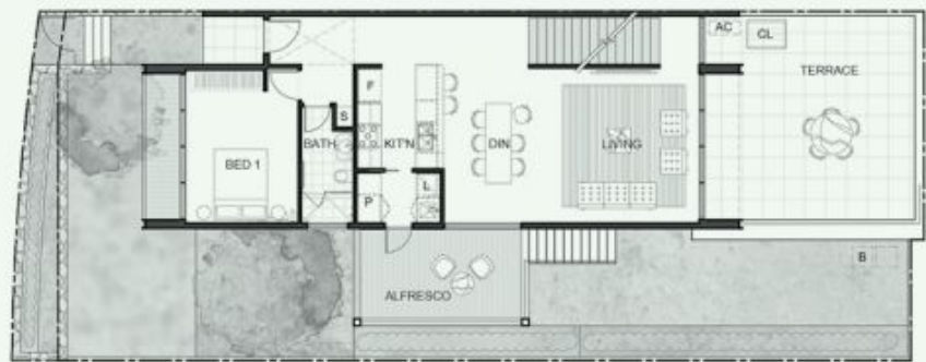
UPPER GROUND LEVEL PLAN