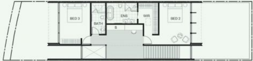
FIRST LEVEL PLAN