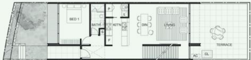
UPPER GROUND LEVEL PLAN