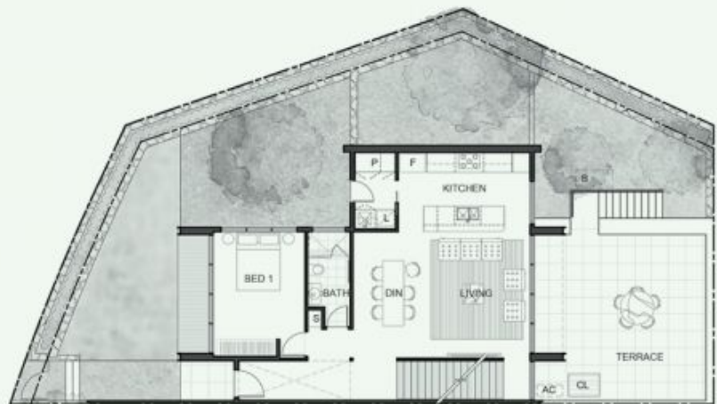
UPPER GROUND LEVEL PLAN