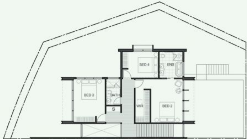
FIRST LEVEL PLAN