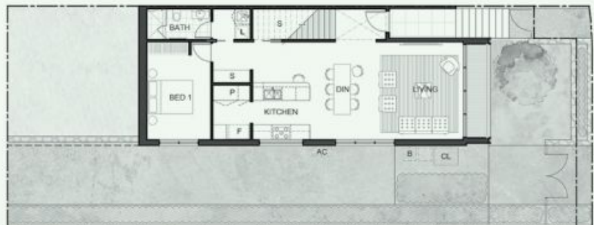
LOWER GROUND LEVEL PLAN