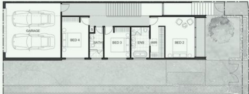
GROUND LEVEL PLAN