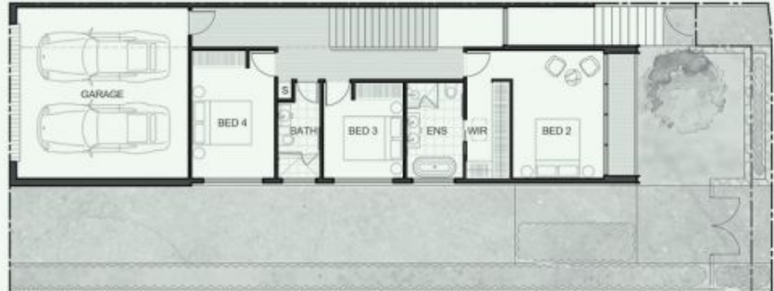
GROUND LEVEL PLAN