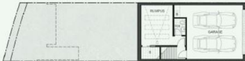
GROUND LEVEL PLAN