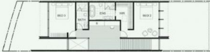
FIRST LEVEL PLAN